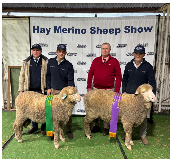
2024 Elders Champion March Shorn Ram - Poll Boonoke

Winners from Champ Med & Champ Strong Wool Ewe Wanganella Trophy $300 cash & Book Prize