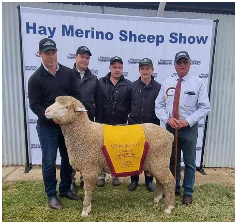
2024 Riverina Wool Australia

Champion Hogget Merino Ram - -Collinsville, South Australia