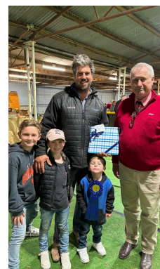
2024 Most Successful Exhibitor, Flock section - Piney Range

~ $500 Cash ~ Most Successful Exhibitor in the Flock Section. Classes 5 & 10 excluded. Points will be awarded as follows:-1st-5, 2nd-4, 3rd-3, Champion-2, Reserve Champion-1