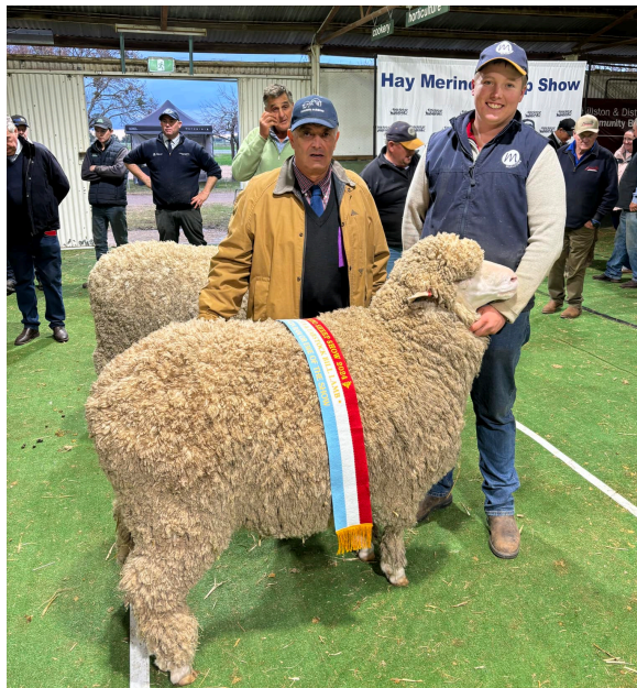
Bill Lamb Perpetual Trophy - Mullorie SA