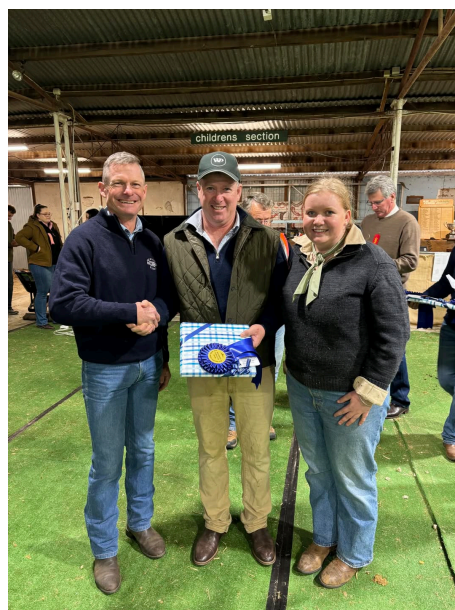
2024 Most Successful Exhibitor - Woodpark Poll

Points will be awarded as follows:- 1st-5, 2nd-4, 3rd-3, Champion-2, Reserve Champion-1