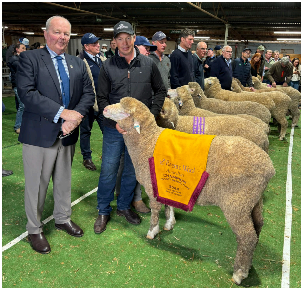
2024 Riverina Wool Australia Champion Hoggett Merino Ram - Collinsville SA

Champion ineligible to compete in single classes