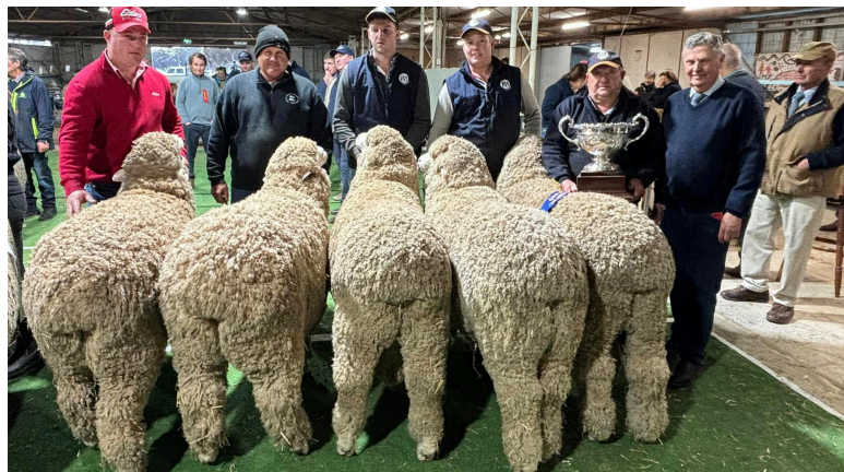
Nelson Mills Memorial Trophy - Mullorie SA