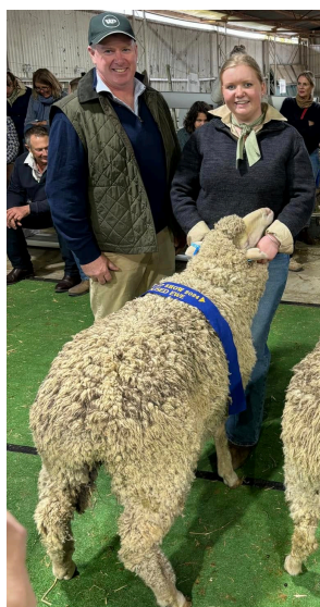
2024 Champion Unhoused Ewe - Woodpark Poll